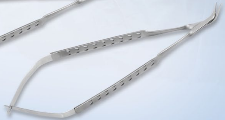
Spring Handle Potts 45° Scissor