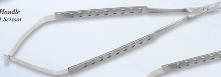
Spring Handle Curved Scissor