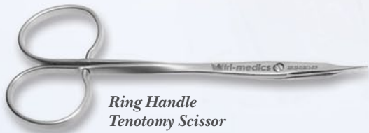
Ring Handle Tenotomy Scissor

The moment you pick up a Tri-Medics Precision Surgical Scissor you feel the comfort, control, and smoothness that you are accustomed to with your precision instruments. You notice how the instrument is light, almost as if it is actually an extension of you, a part of your hand. When you cut with the Tri-Medics Precision Surgical Scissor , you experience the difference of an amazingly sharp, clean, accurate cut right to the tip.