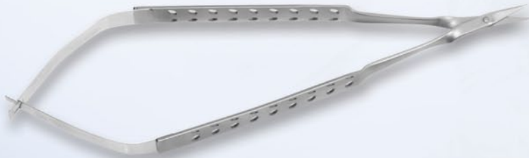
Spring Handle Straight Scissor